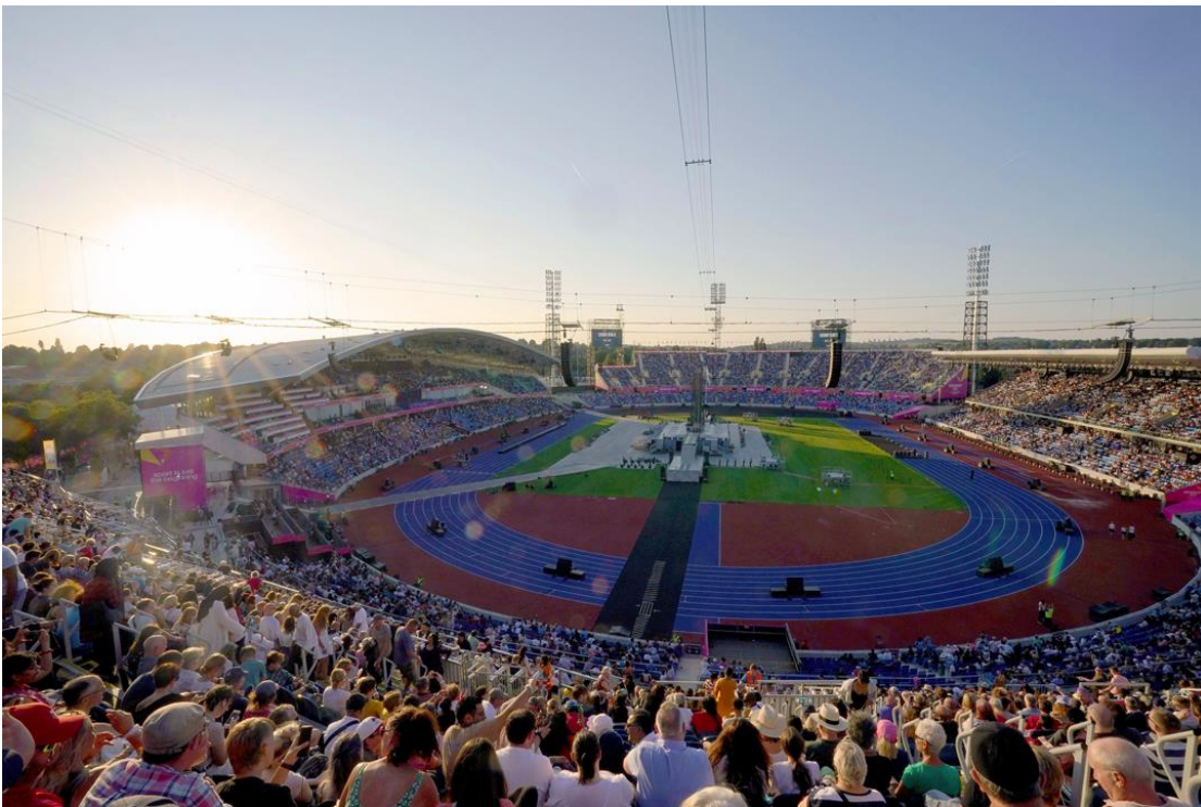
ABU in partnership with AsiaSat and TBS for live coverage of Birmingham 2022 Commonwealth Games including the closing ceremony held at Alexander Stadium on 8 August 2022